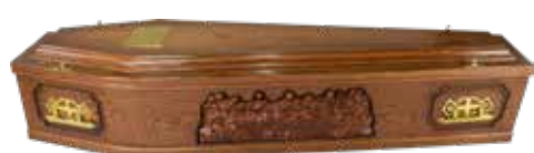
Last Supper £820