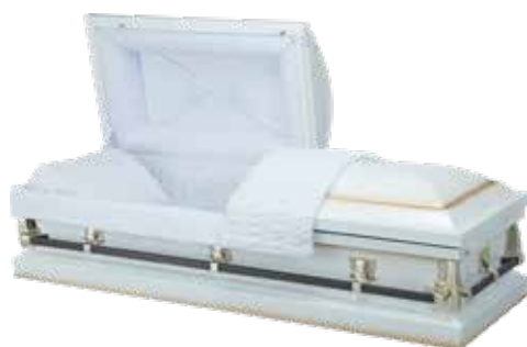
American-Style Caskets* American-style Caskets are available in wood or metal in a wide selection of designs From £1,470